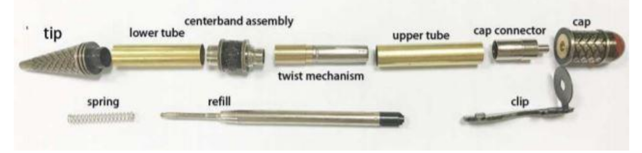
Diagram A – The Parts included in the Kit